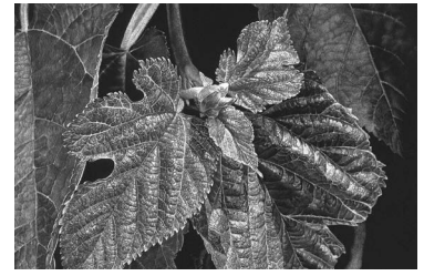
International Society of Scratchboard Artists 9/19-11/30 Opening Reception: 9/19 5-7pm