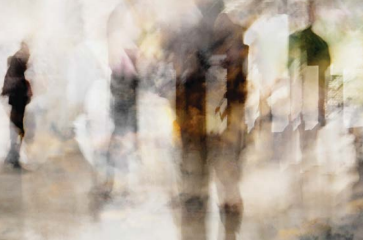
Digital Photo Art by Denis Hagen 10/24-2/8 Opening Reception: 10/24, 5-7pm