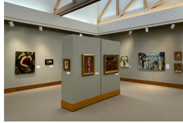
Selections from Collections 12/19-2/24