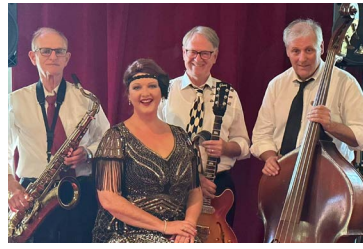
Art After Hours: 9/12, 6:30-8:30pm Live music from Paper Moon in the outdoor amphitheater.