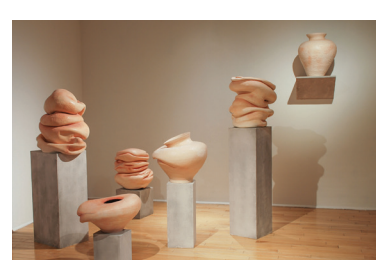
Kelly Devitt: Ritual 5/16-7/20 Opening Reception: 5/16, 5-7pm